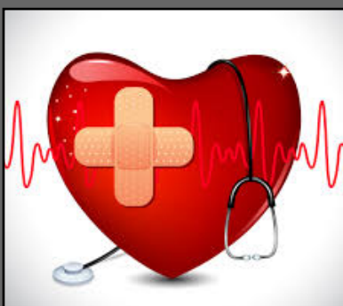
Heart Disease & Nursing page 5