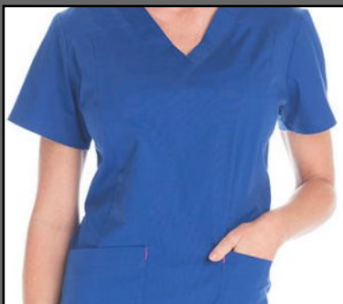
Intern Positions Available page 4