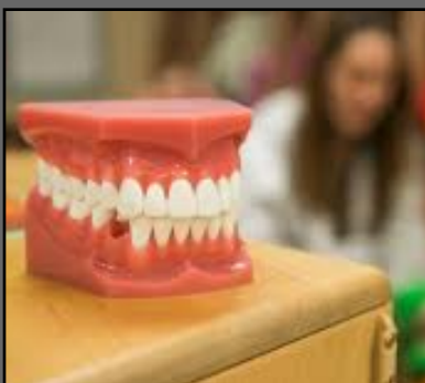
COSL Dental Supplies Drive page 2,3